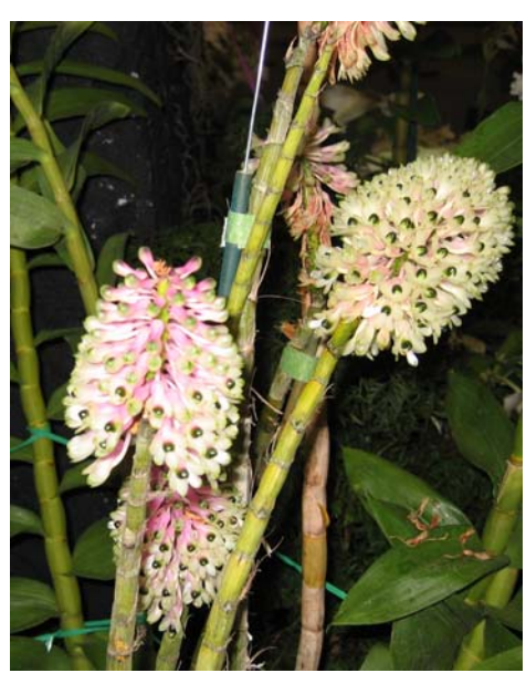
Best Other Color Dendrobium: Den. smilliae H&R Nurseries