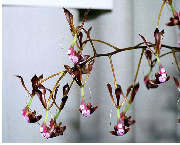
Most Unusual: Epidendrum melanoporphyreum 'J&L H&R Nurseries