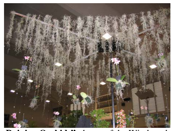
"It's Raining Orchids", theme of the Windward show