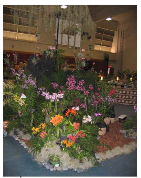
HKOS's 2<sup>nd</sup> place Exhibit in the Windward Show